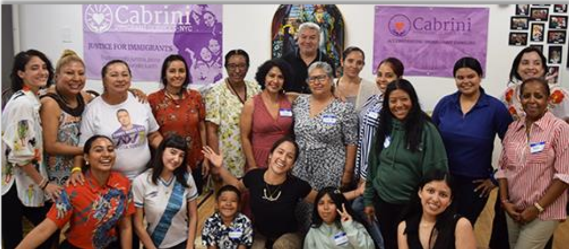
Immigrant Heritage Month was marked by fun, food, festivity and salsa dancing at CIS-NYC.

In celebration of Immigrant Heritage Month, Cabrini Immigrant Services of NYC (CIS-NYC) welcomed 20 participants for a wonderful community potluck. Clients brought traditional dishes from their home countries, giving everyone the opportunity to share and enjoy a variety of cultural foods.