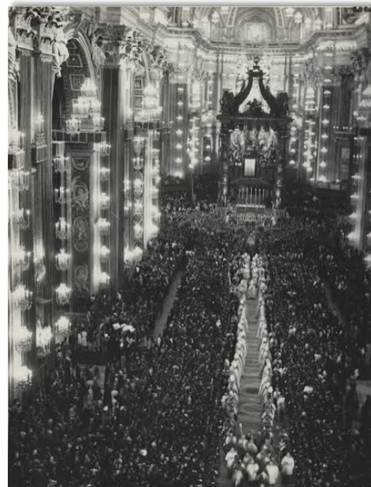
The Canonization Mass of Mother Cabrini in the Vatican on July 7, 1946.