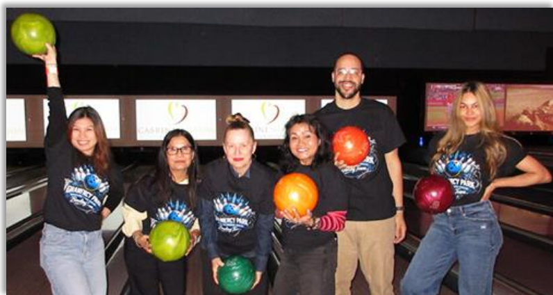
Photos above and below: CMF Bowling Event guests have fun as they “strike” a pose at Lucky Strike at Chelsea Piers.

Everyone had a ball at Cabrini Mission Foundation’s Annual Bowling event. Hosted at Lucky Strike in the Chelsea Piers in New York City, attendees got together to showcase their ‘unbowlievable’ skills, while others hung back to cheer on their favorite teams.