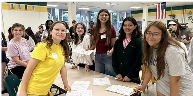
The Welcome Night was marked with lots of fun activities for students and parents alike.

Parents were equally engaged, connecting with members of the Cabrini Dads' Club and the Parents Association. These conversations highlighted the strong network of support that defines the Cabrini experience, not just for students, but for families as well. Faculty and administrators were also present throughout the evening, offering a warm welcome and sharing their vision for guiding each student's academic and personal journey.