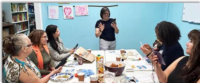
With their phones at the ready, the participants are eager to apply these helpful tips.