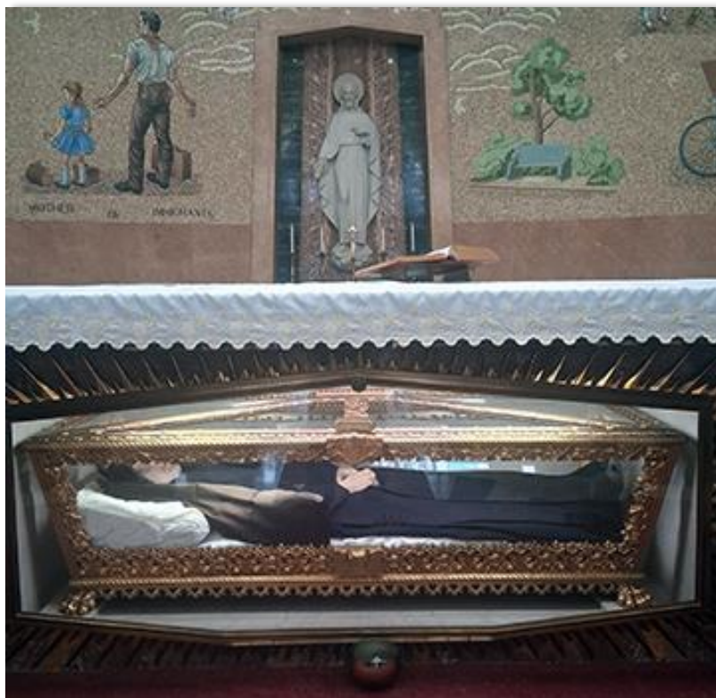
The names of the perpetual pilgrims sit in a small brass bowl in front of Mother Cabrini's relic.