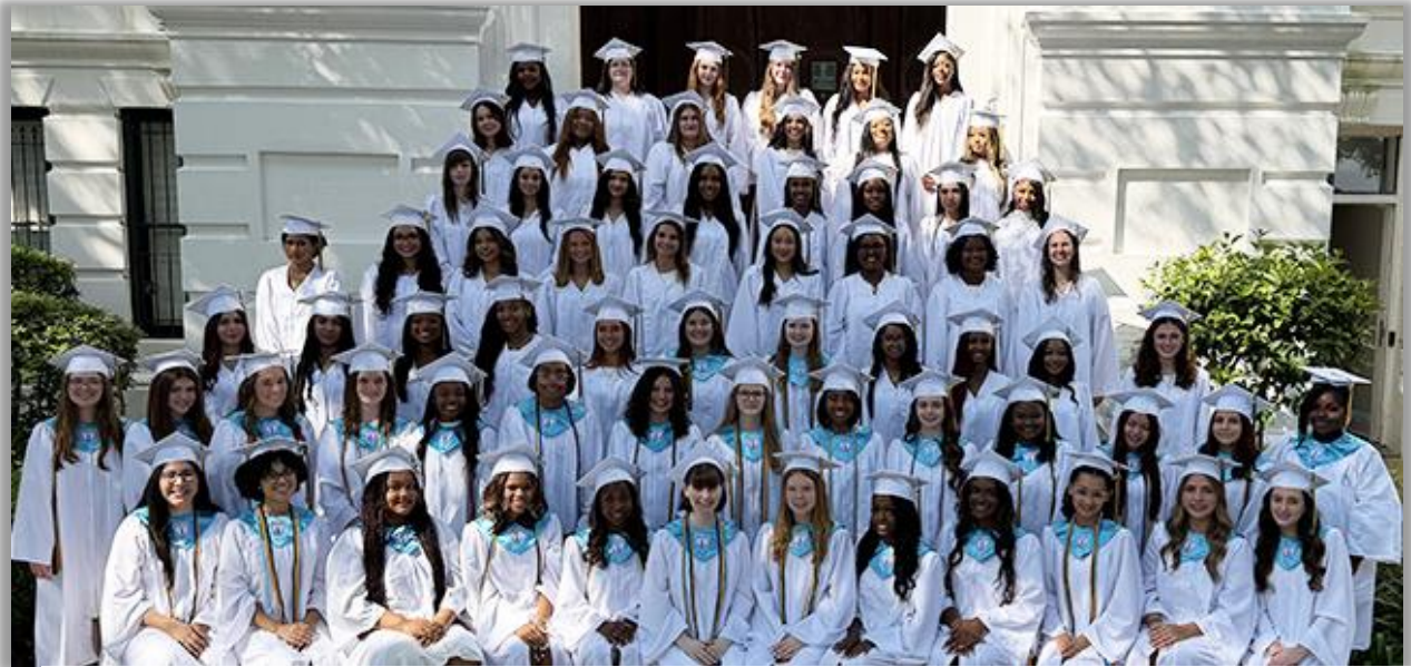
The Cabrini High School Class of 2026

Cabrini High School is celebrating an extraordinary season of achievement and investment in its students' futures.