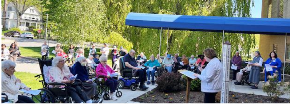
Residents and staff gathered around the Peace Pole at St. Cabrini Nursing Home to unite their voices in prayers for peace.

On Friday, May 1 st residents, staff and volunteers at St. Cabrini Nursing Home in Dobbs Ferry, NY gathered outside