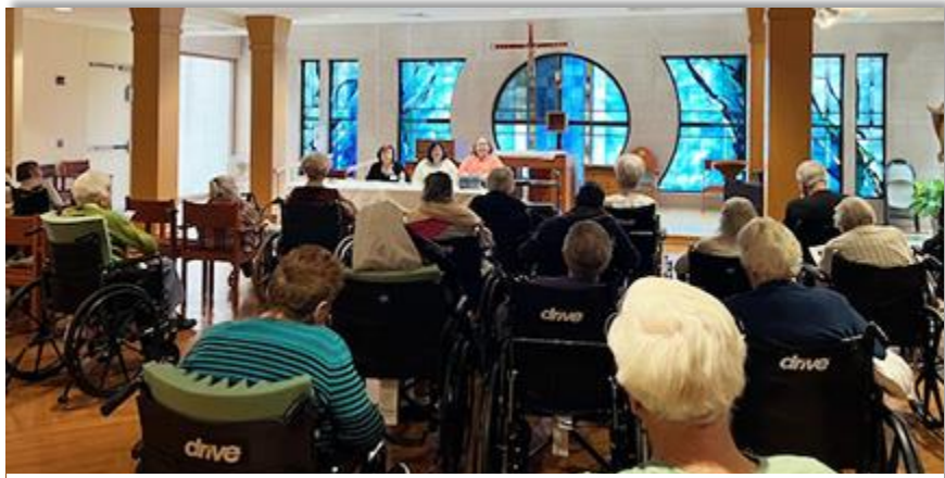
The panel discussion was a highlight of the Holy Week.