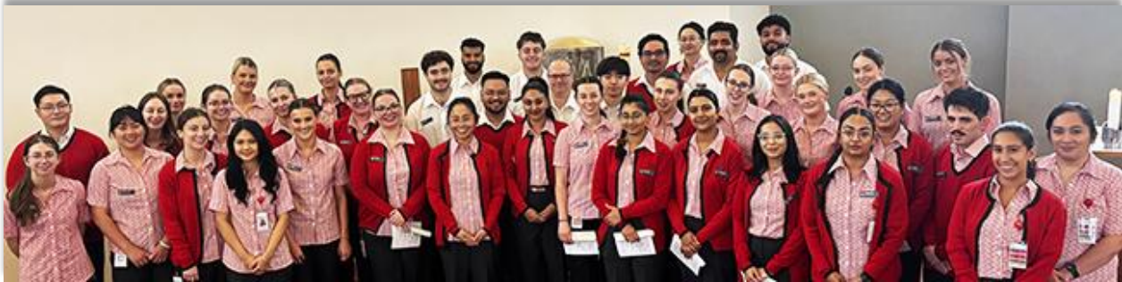
Congratulations to the Cabrini Health nurses and midwives graduate cohort!

The 2026 Cabrini Australia nurses and midwives graduate cohort is the largest in the Program's history. It also contains more Cabrini DNA than any cohort that's come before it. Forty-one graduates were blessed before a large crowd of family, friends and colleagues in the Chapel on Monday 27 April, taking the total number of 2026 graduates to 90.