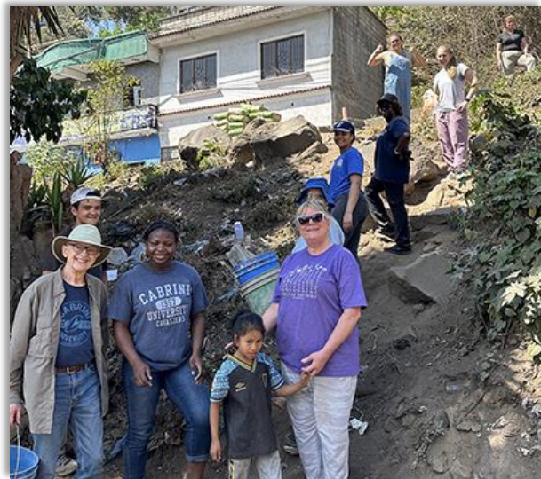
A Cabrini bucket brigade transported gravel to the site. Local youngsters were eager to help!

This day, the group traveled to a construction site at a family’s home which sat below a steep embankment. They had to establish a safe and efficient way to bring buckets of gravel down the hill. They were befriended by a little girl who wanted to help and who also recruited her young cousins to assist. The determination of the children touched the hearts of the group.