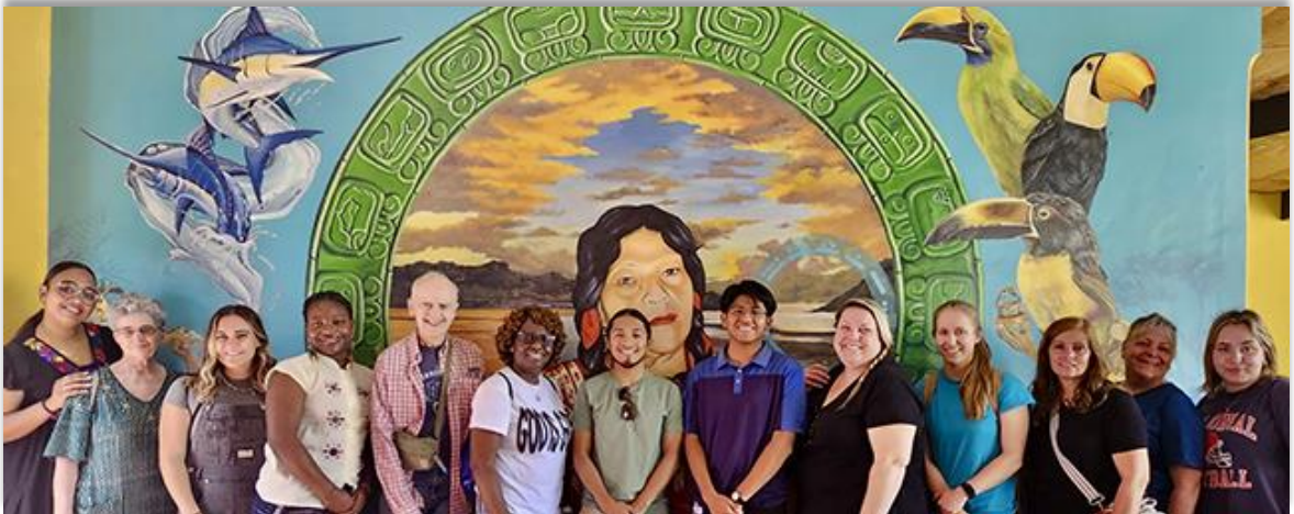
Each element of the murals holds significance which they learned directly from the artists.

Learning about the colorful murals in San Lucas Toliman was a focus of the day. They heard directly from the artists about the symbolism and culture behind the artwork.