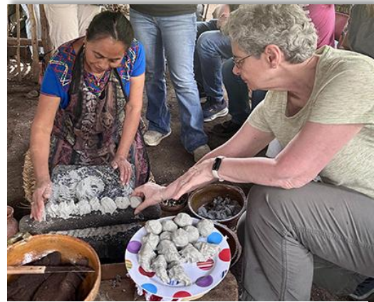
Making tortillas the traditional way.

They learned that the Maya people very much honor their culture and traditions of their ancestors. Many tasks are still done manually and require a great deal of effort. The group noted this was a humbling experience since we are so accustomed to modern conveniences.