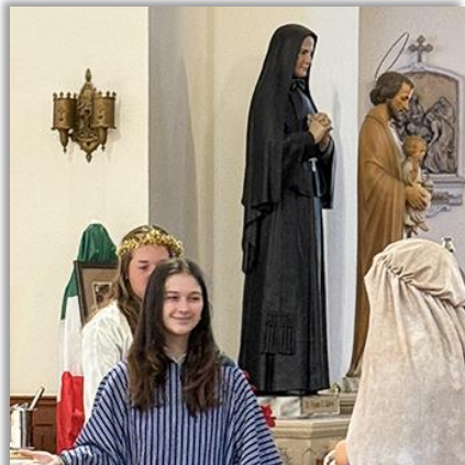
Students reenact the Holy Family seeking shelter during the Tupa-Tupa ceremony.

Cabrini High School’s annual St. Joseph Altar opened on March 18, 2026, welcoming students with the traditional “Tupa-Tupa” ceremony, a reenactment of the Holy Family seeking shelter before the birth of Jesus. Created in partnership with the Elenian Club, the oldest Italian women’s club organization in the United States, the altar reflected months of care, shared devotion among students, alumnae, and volunteers, and a strong commitment to tradition.