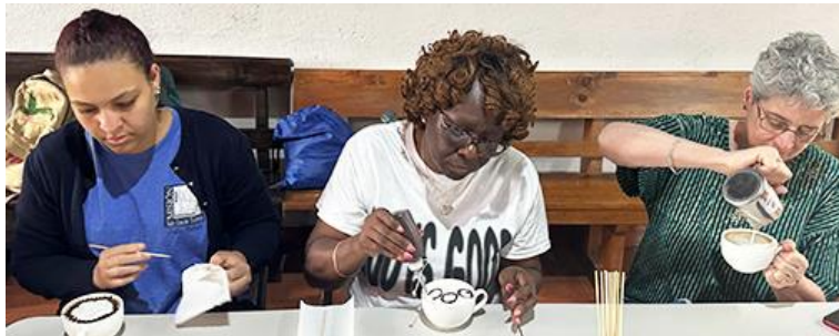
Each cup of latte is a work of art.

Later in the day they attended a presentation on coffee beans and their preparation.