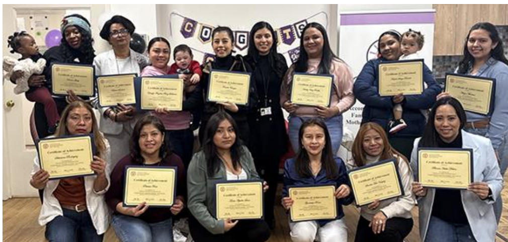
Proud of their accomplishments, the graduates of the Cornell/Cabrini Nutrition Workshop display their diplomas.

On Friday, March 13th, the graduation ceremony for the Cabrini Nutrition Workshop took place. Thirteen participants from various countries, including