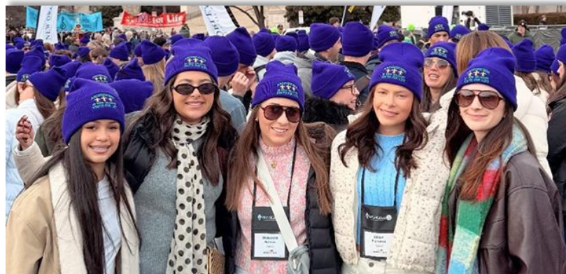
Cabrini students attend the March for Life in Washington, D.C.

School spirit will be on full display this weekend as our cheer and dance teams take the national stage together for the first time. The teams will travel to Orlando to compete at the ESPN Wide World of Sports Complex, a venue used by collegiate programs from across the country. Their hard work, unity, and commitment have brought them to this milestone, and we are proud to see them represent Cabrini on such a prominent stage.