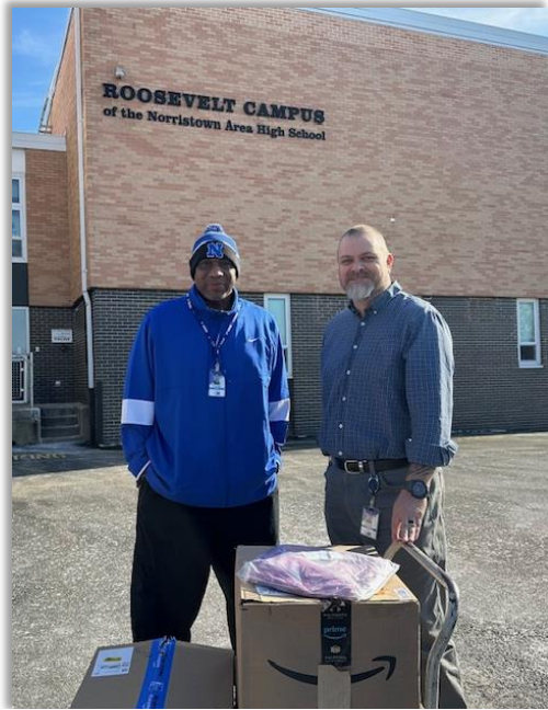
Large boxes of new coats for high school students were delivered to the staff in the Norristown School District.

Cabrini University alumni and friends, in collaboration with the MSC Cabrini Immigration Commission, rallied before Christmas to donate winter clothing