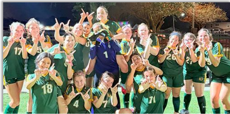
CHS soccer team is on fire as they celebrate victory after victory.

Excitement continues to build around the progress of our gym renovations with the completion of the first phase now unveiled. That renewed space made an immediate impact as our basketball team opened play in the gym with a big home victory, an