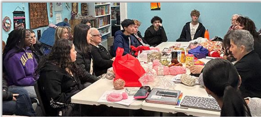
Students from The Masters School spend time in conversation with members of the Knitting Group of CIS-DF.

Cabrini Immigrant Services – Dobbs Ferry, NY (CIS-DF), had a special visit from some high school students who attend The Masters School in Dobbs Ferry. The students are enrolled in a special course entitled: Bring People Together Through Culture, Communication and Community .