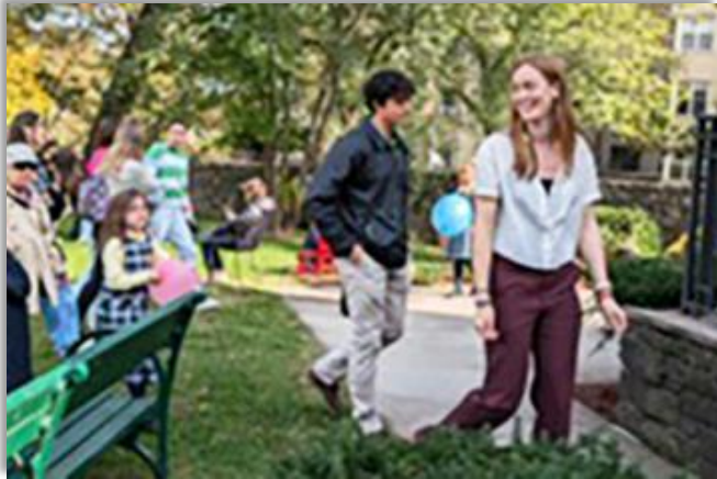
Photo above: People of all ages arrive at the St. F.X. Cabrini Shrine in NYC for the Family Day of Hope.