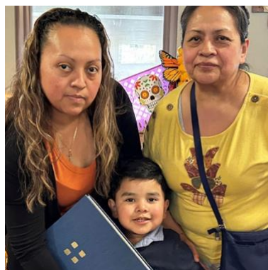
Multi-generations joined in the celebration.

Services, (CIS) Dobbs Ferry, NY, shared their celebration of Día de los Muertos, (the Day of the Dead), with the residents at St. Cabrini Nursing Home.