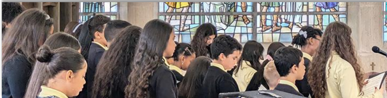
The Good Shepherd School choir raised their voices in song which was a musical treat for everyone present.