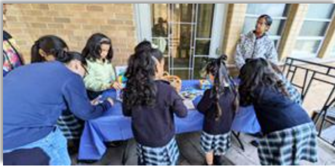
Photo below: Youngsters engaged in making special crafts.

On Saturday, October 18 th , an exuberant group of kids and parents gathered at St. Frances Cabrini Shrine in New York to celebrate a Jubilee Family Day of Hope. Designed as a close-to-home pilgrimage families could take together, the day included talks about hope, Mass, activities (writing postcards to refugee children, making a prayer bracelet, a color-your-own holy card, and creating a saints candle), and finished up with putting together packages for the homeless with the help of the Sant'Egidio Community.