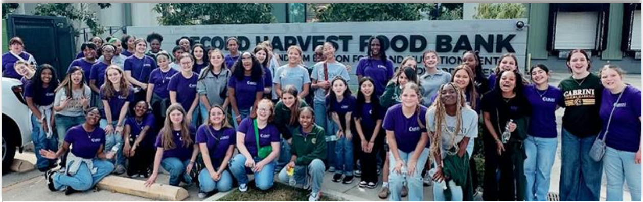
The CHS Class of 2029 volunteered at Second Harvest Food Bank, filling boxes of goods to be distributed throughout the region to serve the homeless, hungry, and marginalized.

What happens when busloads of Cabrini Crescents show up at Second Harvest Food Bank for a service day? Hearts open wide, and the Holy Spirit transforms lives! Service was at the core of Mother Cabrini's mission to uplift the marginalized, and we are honored to continue that legacy through our Campus Ministry Department.