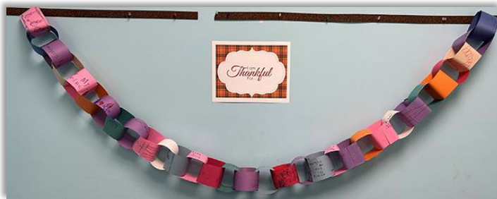
It's no accident that this paper chain of blessings looks like a smile.