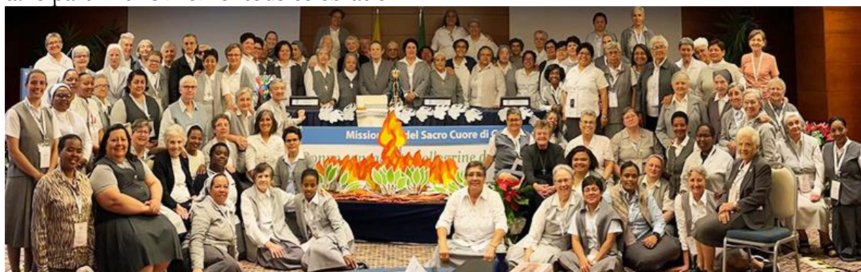
The Missionary Sisters of the Sacred Heart of Jesus attending the Jubilee for Consecrated Life.

These words were realized when ninety-five Missionary Sisters of the Sacred Heart of Jesus gathered in Rome to celebrate the Jubilee of Consecrated Life and to participate in a General Assembly. The Sisters traveled from Asia, Europe, and the Americas to take part in this momentous celebration.