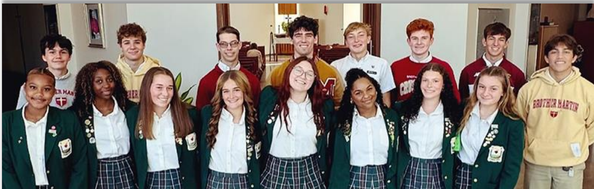
Cabrini Retreat Team members joined forces with Brother Martin High School's retreat team to host student-led days of faith formation for grammar school students throughout the Archdiocese.

This fall, our students began a new service and retreat initiative designed to help them live out their faith in tangible ways. Each class is participating in a two-day retreat experience: day one dedicated to service at Second Harvest Food Bank, and day two a class retreat focused on reflection, prayer, and community building. These experiences remind our students that living the Gospel means putting love into action.