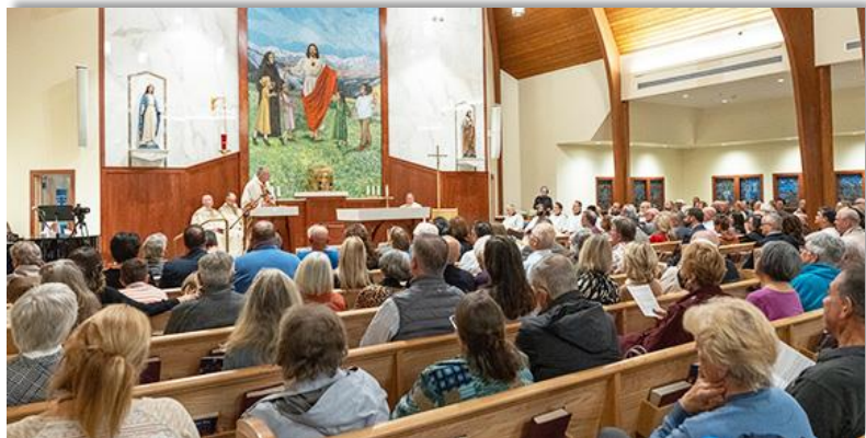
The Mother Cabrini Shrine chapel overflowing on Mother’s Day.

liturgies were filled to capacity, with overflow seating needed to accommodate everyone who came to celebrate the special day. After each Mass, the community gathered in the cafeteria for a warm and welcoming brunch prepared by the Shrine’s kitchen staff. The turnout was so strong, not a crumb was left in sight!