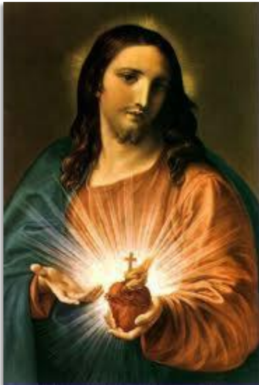
Artist Pompeo Batoni's rendering of the Sacred Heart

Jesus revealed his Sacred Heart devotion to Saint Margaret Mary Alacoque in several mystical visions between 1673 and 1675. To commemorate the 350th anniversary of the Apparitions of the Sacred Heart of Jesus to St Margaret Mary in Paray-le-Monial, a Jubilee lasting a year and a half has taken place from December 27th 2023 , the anniversary of the first main apparition, to June 27th 2025 , the date of the Solemnity of the Feast of the Sacred Heart and the 350th anniversary of the final apparition.