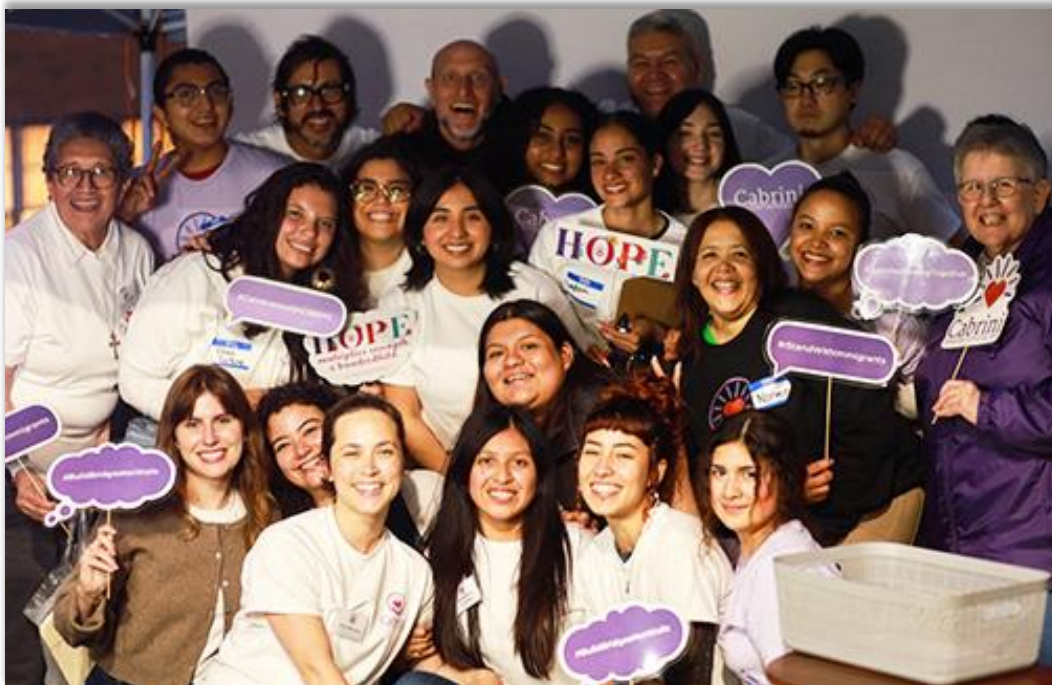
Missionary Sisters, CIS-NYC staff members, friends, and honored guests, enjoyed the evening of HOPE, friendship and community at their fundraiser.

Despite the rain, last Saturday's fundraiser was a beautiful, joy-filled evening that reminded us of the strength and love in our community. We celebrated 26 years of Cabrini Immigrant Service with this year's theme of HOPE. Hope is a word that reflects not just what we feel for the future, but what we actively build together. In a time when many in our community face fear and uncertainty, hope is our refusal to give up. We gathered to celebrate our collective work, honor incredible leaders, raise support for immigrant justice, and commit to hope for a more just future for all.