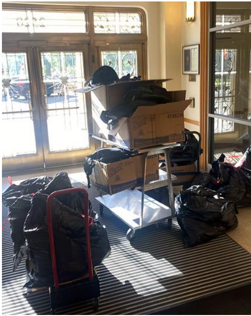
Bags containing 120 backpacks were filled and ready to be distributed by Cabrini Shrine staff at Cradles to Crayons.