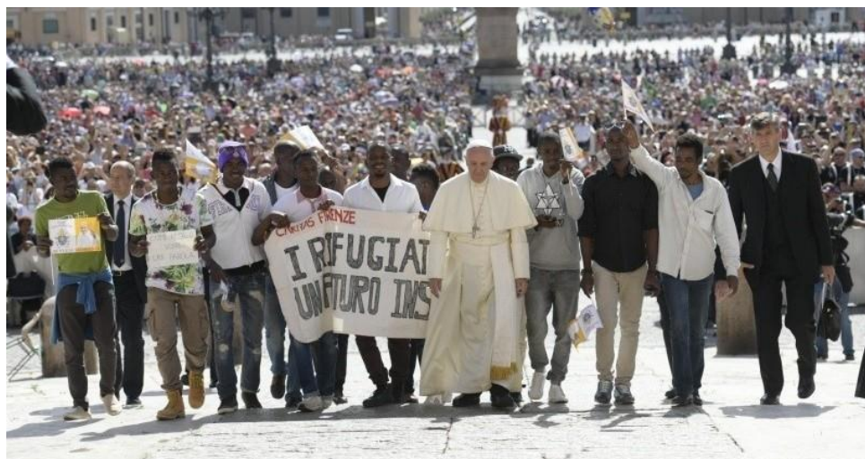
Pope Francis walks with those who are migrants and refugees.

The Catholic Church observes the World Day of Migrants and Refugees on the last Sunday of September each year. Leading up to September 29, the Catholic Church in the United States is celebrating National Migration Week (September 23-29), calling attention to the challenges confronting migrants and refugees, from their country of origin to their destination, and how Church teaching calls on Catholics to respond with compassionate acts of love. Catholic dioceses, schools, charitable organizations,