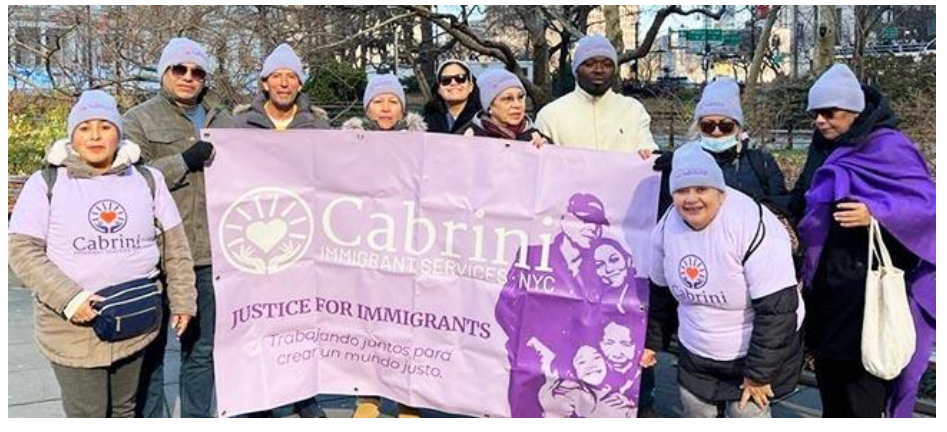
Photo above: After the Justice for Immigrants leadership training, participants put their new skills to good use as they advocated for the Unemployment Bridge Program.

they mobilized for a moving action to advocate for the Unemployment Bridge Program. This legislation would create an unemployment benefit program for excluded workers, such as undocumented immigrants.