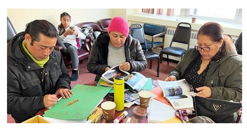
At the Justice for Immigrants leadership development training, participants utilized crafting to share their personal narratives.

On Saturday, December 9<sup>th</sup> we held the first session of our leadership development training, where Justice for Immigrants members did a deep dive into community organizing and storytelling. Participants delved into the art of crafting and sharing personal narratives, equipping themselves with powerful tools for advocacy. Together,