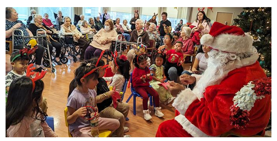
It's hard to tell who is more excited about the arrival of Santa...the young or the young at heart. Everyone is smiling. Everyone loves jolly Santa!

St. Cabrini Nursing Home in Dobbs Ferry, NY, certainly has the 'Spirit of the Season.' Every floor and every unit are decorated for Christmas. There is a lot of excitement amongst the residents and the staff.