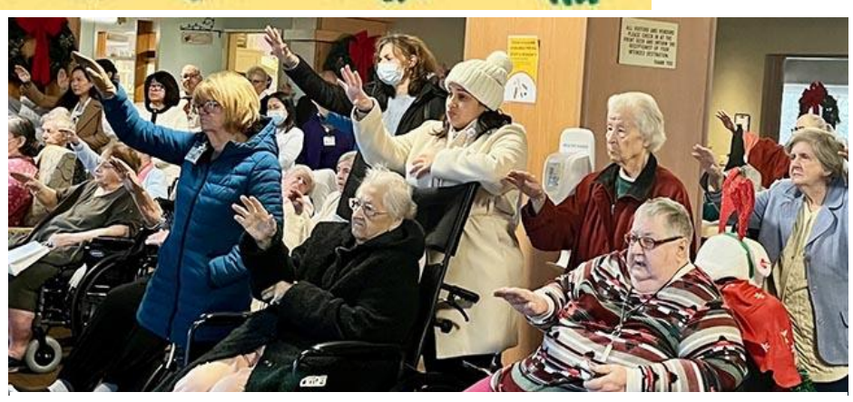
Cabrini of Westchester residents and students extend their hands in a blessing for the Advent season.

On Wednesday, December 6<sup>th</sup>, the residents and staff of Cabrini of Westchester braved the cold weather at a brief prayer service for the blessing of the outdoor nativity scene. While the prayer service took