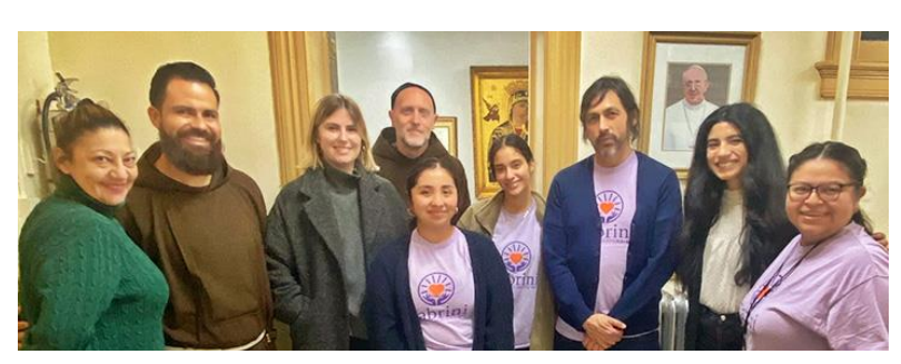
CIS-NYC collaborating with St. Michael's Church for individuals applying for Temporary Protected Status.

On Friday, we also hosted a legal clinic in collaboration with Saint Michael's Church in Brooklyn. At the clinic we were able to assist 17 individuals with applying for Temporary Protected Status, a program which allows migrants whose