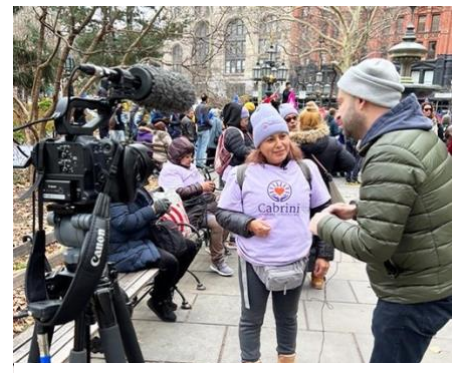
Photo above and right: Justice for Immigrants member is interviewed by PBS as they all march to City Hall.

working hard to ensure all of our clients who are eligible for this status are able to apply.