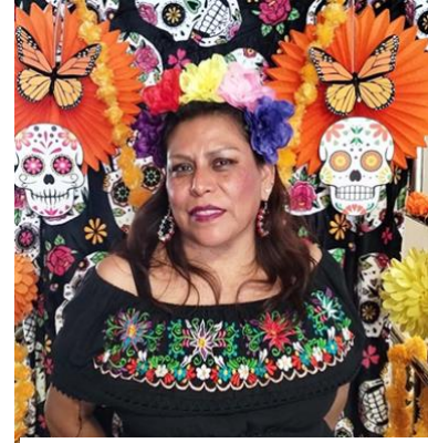
CIS clients in Dobbs Ferry, NY wore traditional dress for the observances, and shared stories of their deceased loved ones.

The clients spoke about the altar and the meaning of the different items. There were pictures of their loved ones on the altar. Special flowers, fruits, bread, sugar skulls and candles were also placed on the altar. Not only do the items have special meaning, but it is also important to have many colors exhibited.