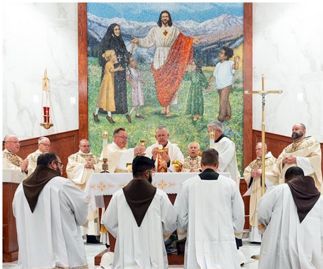
Many priests concelebrated the rededication Mass.