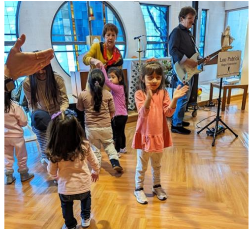
Hands were clapping and toes were tapping as the youngsters invited the St. Cabrini Nursing Home residents to join them in celebrating International Children's Day. Everyone got into the beat!