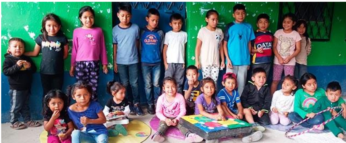
These youngsters attended the Vacation School which commenced on November 6 th .