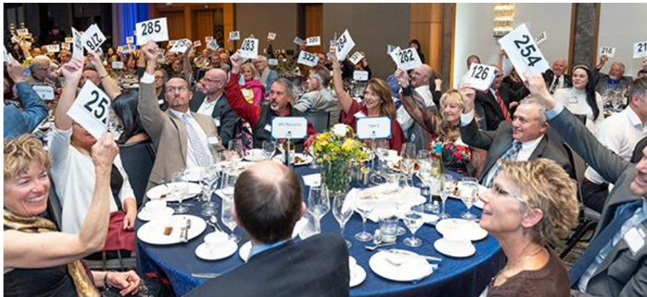
Photo below: All those numbers in the air during the live auction at the Gala are proof positive of the generosity of Shrine benefactors.

expand and renovate the Shrine’s gift shop and chapel, and retreat facilities so that visitors can have the best experience possible for decades to come. The account continues on next page.