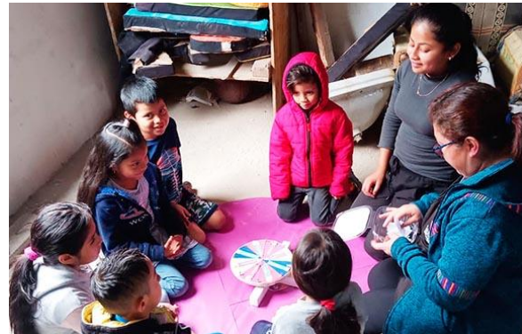
The children are attentive to this interesting activity.