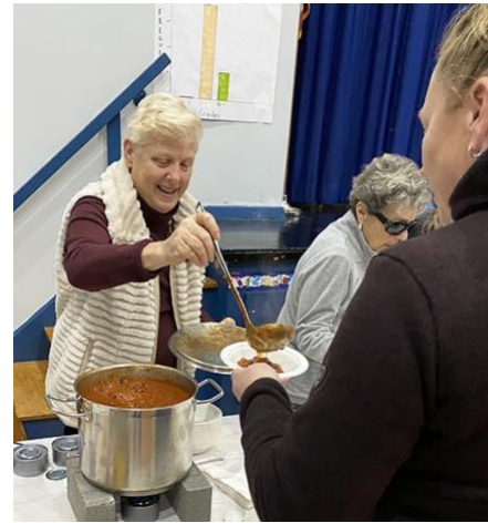
A lot of love and varied ingredients go into making a satisfying and savory chili.