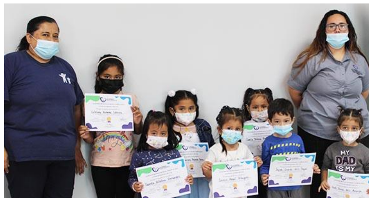
The children proudly share their diplomas and certificates of accomplishment.

The closing of our Modified Spark Project "CHISPA MODIFICADO", which ends its 2023 school year to start a new one. In this project, children from 4 to 12 years old are accepted, where it is about teaching by playing. During this event, games were held and diplomas were given to the children who throughout the