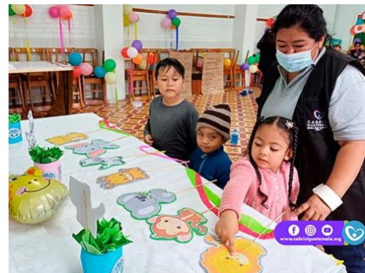
Photo above and left: Children's Day helps track children's weight and height amidst a setting of fun and games!