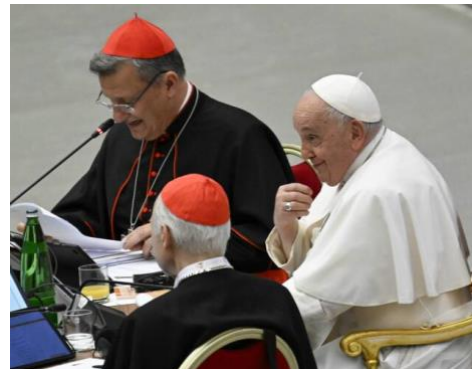
Pope Francis smiles at a point of discussion during the Synod proceedings.

Among members of the assembly, the report said, some thought the idea of women deacons would be a break with tradition, while others insisted it would "restore the practice of the Early Church," including at the time of the New Testament, which mentions women deacons.