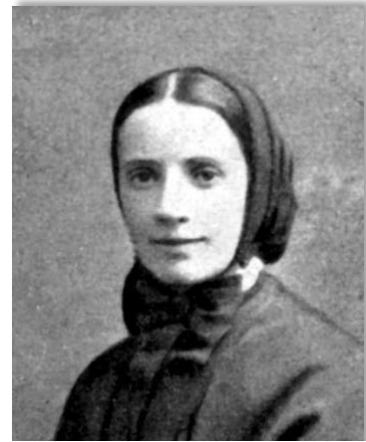
Mother Cabrini, Foundress

In this way, her missionary adventure began, entirely oriented toward preparing for the missions of China that she had desired since childhood, but the rapid development of her institute and foundations, the fame of her abilities, and the impressive number of young women who asked to join her Institute attracted the attention of Monsignor – now Saint - Giovanni Battista Scalabrini, Bishop of Piacenza. He invited her to devote herself to Italian immigrants who left for the Americas in search of fortune and who were living in desperate conditions, especially in North America.