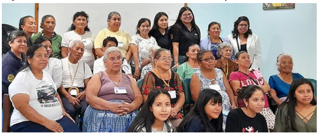
The programs for senior citizens are intergenerational. Teenagers volunteer their time in serving with the program. Everyone benefits!

The elderly taking part in this program are nourished in all aspects of life. The MSCs in the mission share the gift of faith with the participants at the beginning of every gathering with a word of prayer, scripture sharing or faith-based sharing. Nutrition departments share their wisdom on how the elderly should master their diet. The