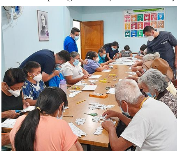
Staff members and student volunteers assist with the various activities provided by the program.

The people love taking part in the program every Monday and Friday. They enjoy connecting with their friends, learning, playing, chatting, and doing their exercises or dancing every Friday morning. I love the way they greet each other and the way they share their concern among themselves. I appreciate the way they share stories and laugh aloud. They are simply full of life. I have been enjoying this program and I am full of gratitude for the fact that I am able to take part, help,