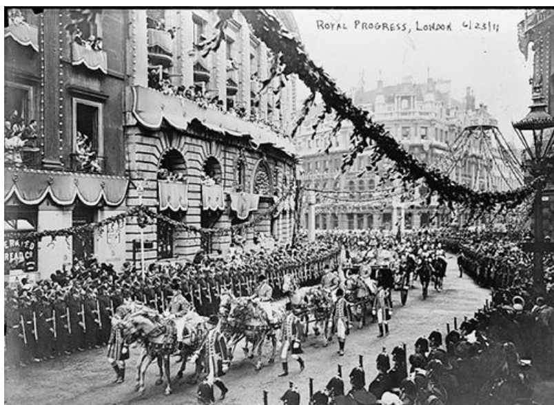
The Coronation Procession of George V and Queen Mary in London on June 23, 1911.