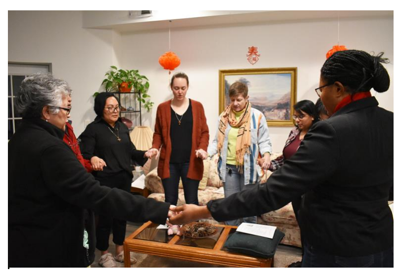
At the conclusion of evening prayer at the Intercongregational Collaborative Novitiate, novices and directors share the Lord's Prayer each in her own native language.

Being able to laugh while trying to learn the steps to an African dance, experience a liturgy at a Ukrainian Church or discuss facets of Black History Month has been an integral part of the past eight months for a group of six novices, who have bonded into a distinct community.