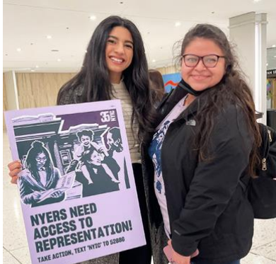
CIS-NYC staff attorneys in Albany, NY.

Lastly, this week another group of Justice for Immigrants members traveled to Albany as part of the Worker Solidarity Day of Action where they took part in an action and meetings with elected officials to advocate for the passage of the Unemployment