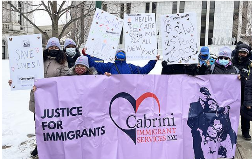
Braving the wintry conditions, representatives of CIS-NYC and Justice for Immigrants demonstrated recently in Albany, NY for #Coverage4All.

In recent weeks, Cabrini Immigrant Services of NYC (CIS-NYC) staff and Justice for Immigrants members have been busy taking action in New York City and Albany to advocate for the needs of our immigrant community in New York State.