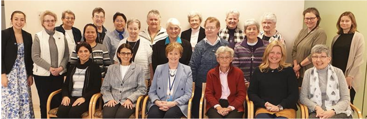
The UNANIMA International Board members gathered at the Cabrini Apartments last month for a meeting.

From Feb. 23 – 25 the UNANIMA International Board members met in NYC at Cabrini Apartments on E. 19 th Street. The representatives from each of the 23 member congregations of religious women form a unique group, spanning 85 countries. It was a wonderful opportunity to meet them plus the administrative staff.