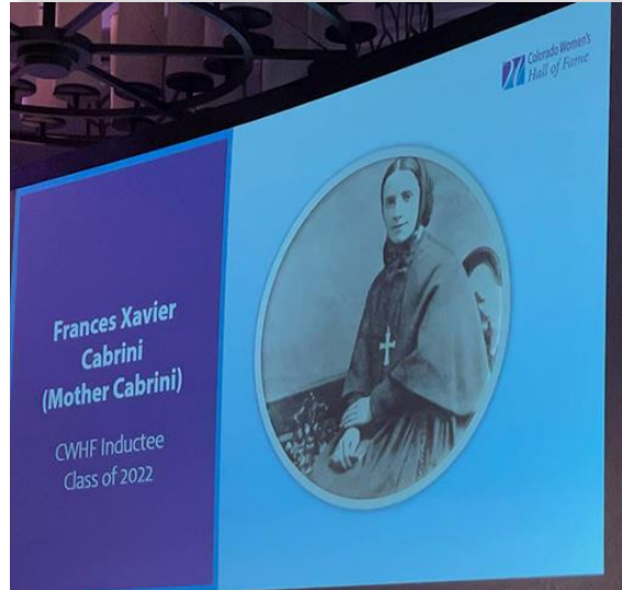
The image of Mother Cabrini was displayed during the Colorado Women's Hall of Fame ceremony in Denver.