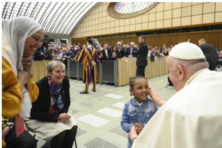
On March 18, at the Vatican Pope Francis greets a child during an audience with hundreds of refugees and displaced people and with those who have assisted them.

The pope only read a few passages from his prepared text, but spent about 25 minutes making his way, seated in a wheelchair, through the hall greeting guests and exchanging many hugs with enthusiastic children. One small boy insisted the pope accept his gift of a stuffed Spider-Man doll.