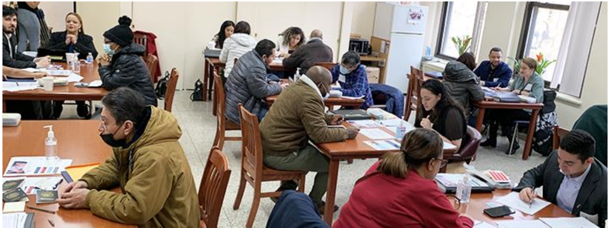
People seeking U.S. citizenship spent time at an event hosted by the St. Frances X. Cabrini Shrine in Upper Manhattan. Individuals were able to meet with attorneys pro bono who provided assistance with complex applications. People were also able to avail themselves of classes and other services.

On March 18, 2023 over a hundred people eligible for U.S. citizenship arrived at St. Frances Cabrini Shrine in NYC where they were helped by pro bono attorneys and volunteers to complete the complicated application. They were also able to apply for fee waivers, sign up for citizenship classes, and enroll in English classes. Many thanks to the good people at Dominicanos USA and CUNY Citizenship Now for their collaboration on this event! ~ submitted by Julia Attaway, St. Frances X. Cabrini Shrine