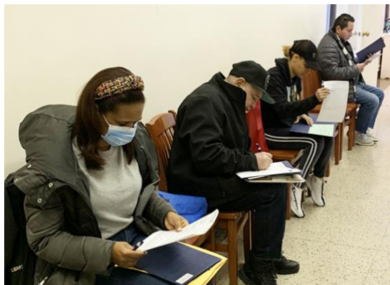
Waiting their turn to discuss their needs, people filled out preliminary paperwork.