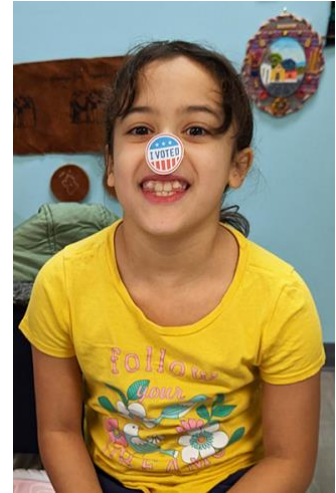
Photo right: Voting is a privilege. There is no doubt that someone is very pleased and proud that she just voted for her favorite USA symbol.

Photo left: This young man looks quite presidential as he is about to deliver his remarks.