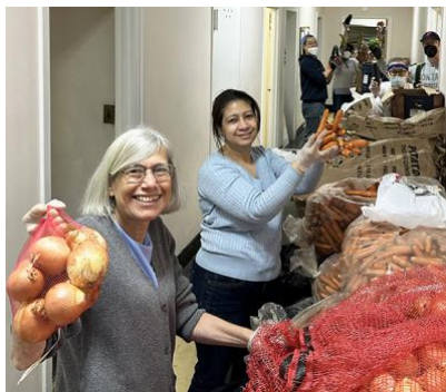
Fresh veggies make for a healthy diet and bring lots of smiles.