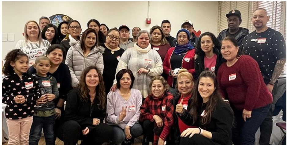
Many group participants and their families gathered at the CIS-NYC

Some of the topics that women have requested are: grieving (honoring our dead), self-compassion, forgiveness, domestic violence, self-care, romantic relationships, women’s role in society, depression, and self-esteem.