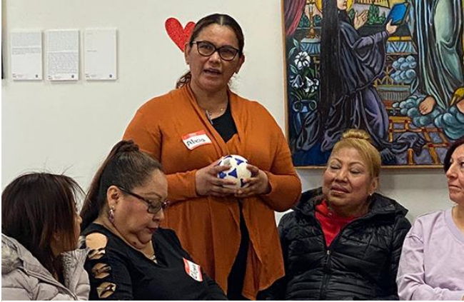
“Voces de Mujeres” has proven to be a welcome support group sponsored by Cabrini Immigrant Services, NYC.

In November 2022 Cabrini Immigrant Services of NYC started the latest cycle of our support group for women, "Voces de Mujeres." While the group was supposed to end this month, we decided to extend the group due to its popularity and the meaningful relationships the women have developed. This virtual support group has provided a safe space for women to share, to heal, and to learn about themselves and other women’s struggles.