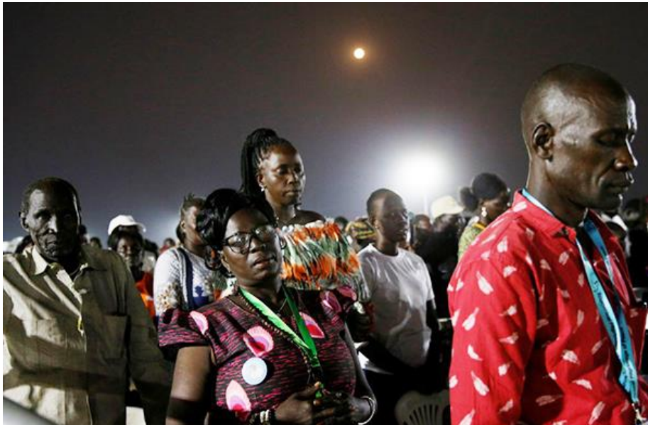
People participate in an ecumenical prayer service attended by Pope Francis in Juba, South Sudan.

referring to the use of adrenaline to jolt someone out of a severe and life-threatening allergy.