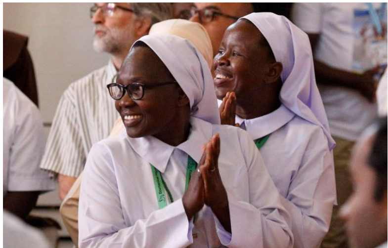
Nuns react as Pope Francis arrives for a meeting in St. Theresa Cathedral in Juba, South Sudan.

Some participants walked 93 miles over nine days to be here for the pope’s visit. Others, who live within the capital, spoke of the long hours it took them to reach the event by foot, given the city’s lack of roads and infrastructure. Even so, at the