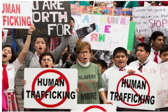
Scenes from the Walk 4 Freedom to end human trafficking.

According to the U.S. Sisters Against Human Trafficking, this crime “occurs when a trafficker uses force, fraud or coercion to control another person for the purpose of engaging in commercial sex acts or soliciting labor or services against his/her will.”