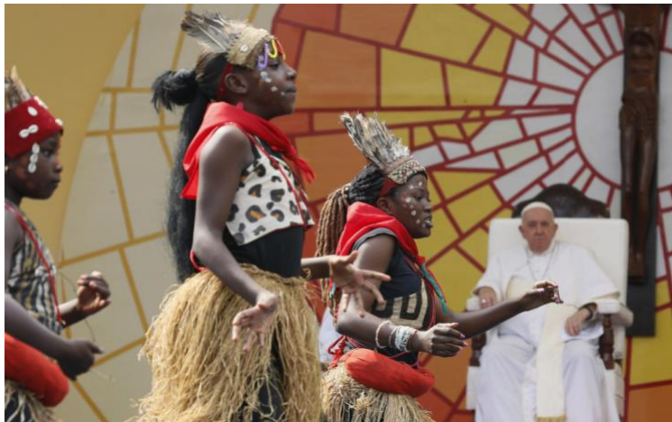
Pope Francis watches as dancers perform in Martyr Stadium in Kinshasha, Congo.

In his visit today to the Democratic Republic of the Congo, going off script, Pope Francis led the tens of thousands of young people in attendance at a super-charged meeting in Martyrs Stadium – the largest sporting arena in the country – on the final full day of his visit here in a spontaneous chant of “no to corruption” – with some of those seated near the country’s political leaders turning to directly face Congo’s top power brokers as they joined in the chorus.