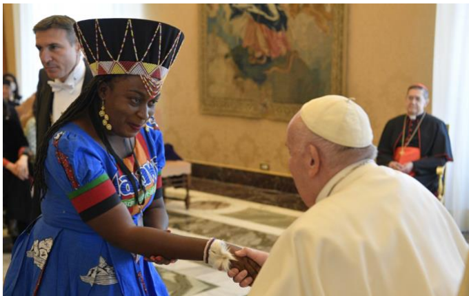
Pope Francis greets a participant of the “Women Building a Culture of Encounter Interreligiously” conference this week at the Vatican.

The world’s religious traditions and their followers are called to offer wisdom to the world and to “infuse it with a spirit of warmth, haling and fraternity,” which requires the participation of women as well as men, Pope Francis said.