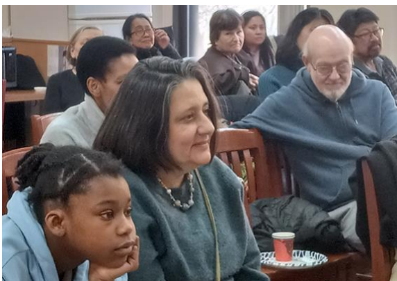
Photo left: The guests listened with rapt attention to all that the novices had to share.