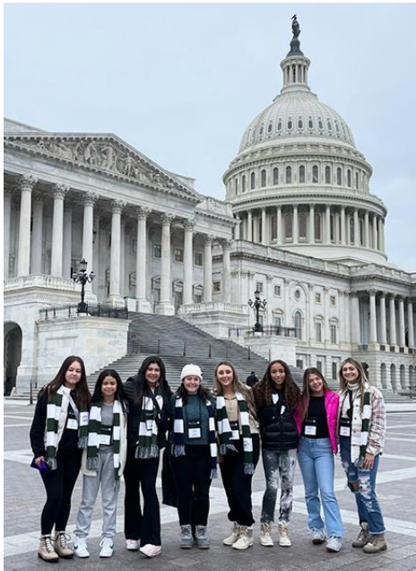
Cabrini High School students pause for a photo at the U.S. Capitol. They joined other students from the Archdiocese of New Orleans in attending the March for Life in D.C.

Eight Cabrini High School (CHS) students embarked on the 24-hour bus trip to Washington D.C to attend the annual March for Life last week. In addition to the march, the students toured the Capitol Building and various museums such as the Smithsonian. They also toured the Basilica of the National Shrine of the Immaculate Conception and ended the trip with Mass at the beautiful St. John Paul II National Shrine. Adoration was held every night with the help of the multitude of priests and seminarians that came from the Archdiocese of New Orleans.