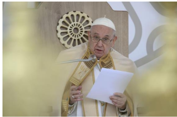
Pope Francis speaks on September 25 at the close of the National Eucharistic Congress.

Migrants are to be welcomed, accompanied, supported and integrated, he said on September 25.