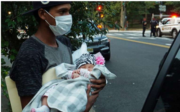
A 1-month-old baby is placed into a vehicle for transport to a safe place in Washington, D.C. after a group of mainly Venezuelan migrants arrived by bus from detention in Texas and were dropped off outside the official residence of Vice President Kamala Harris.

He was one of several bishops to speak out after the latest drop-off of migrants – two groups of mostly Venezuelans who were flown on September 14 to Martha’s Vineyard in Massachusetts.