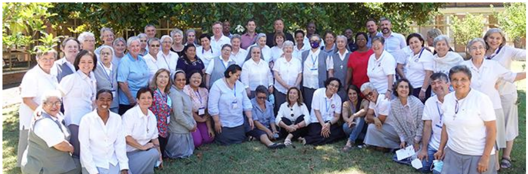
The participants of the General Chapter gather for a group photo before the laity headed home to their respective countries and ministries.