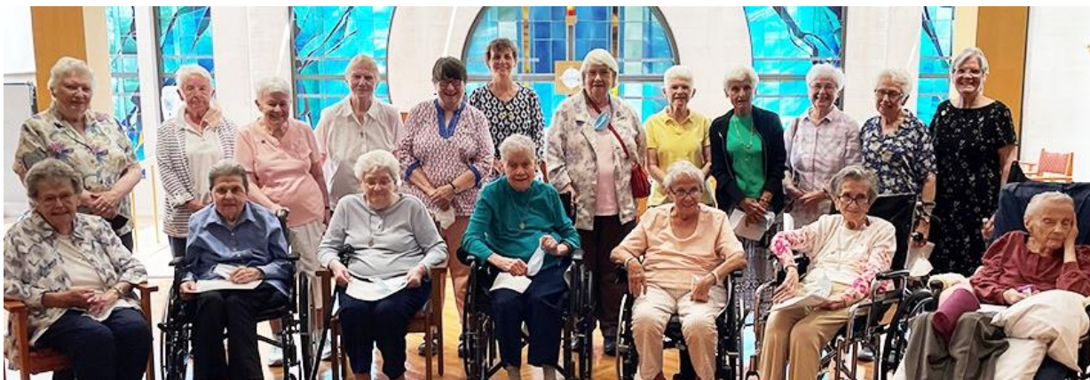
The Sisters of Divine Compassion celebrated their Founder's Day at Cabrini of Westchester on Friday, July 8 th . Six of the sisters are residents of the nursing home. The Missionary Sisters and the Cabrinian community wish the Sisters every grace and blessing.