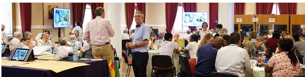
Much of the General Chapter discussion and reflection takes place through smaller table discussion.

July 6 th brought with it reflections and discussions about co-