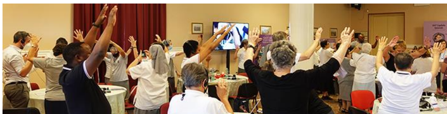
The General Chapter participants extend arms in a blessing.