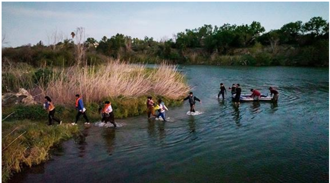
Migrants from Central and South America exit their raft onto an island in the middle of the Rio Grande near Roma, Texas, June 11, 2022.

The effort asks that countries such as Costa Rica and Ecuador, with proximity to nations such as Cuba and Venezuela, take in and protect more refugees from those neighboring nations instead of having them make longer and more dangerous trips north to the U.S.