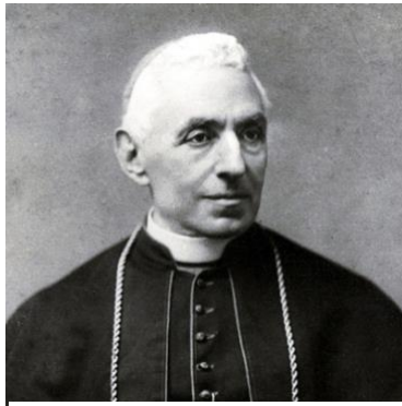
Bishop Giovanni Scalabrini

In decrees approved on Saturday, May 21, Pope Francis approves the canonization of Blessed Giovanni Battista Scalabrini and Blessed Artemide Zatti.