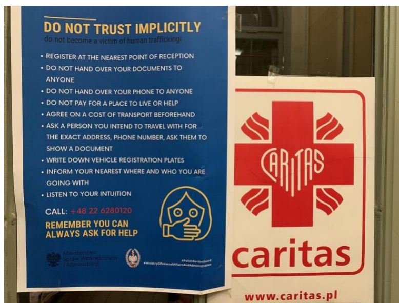
A sign on the office of Caritas at the train station in the Polish border town of Przemysl instructs Ukrainian refugees, especially women, on how to avoid becoming victims of trafficking or falling into the clutches of unscrupulous people.

The crossing is lined with dozens of tents offering free food – including hot soup and pizza fresh from fiery ovens – hot tea and other beverages, free phone calls, medical care, logistical support and more. But the volunteers staffing the tents were having a very slow night.