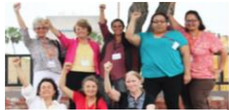
Angry Tias & Abuelas