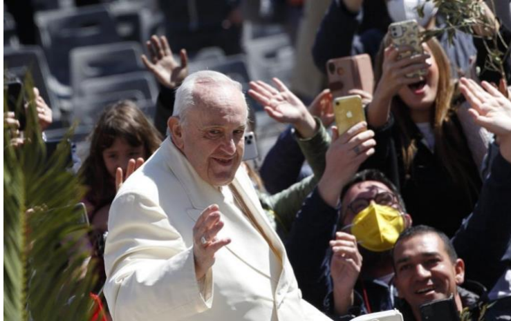
Pope Francis greets the crowd after celebrating Palm Sunday Mass in St. Peter's Square at the Vatican April 10, 2022.

VATICAN CITY – Pope Francis opened Holy week on April 10 with a call for an Easter truce in Ukraine to make room for a negotiated peace, highlighting the need for leaders to “make some sacrifices for the good of the people.”