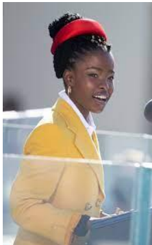
Poet Amanda Gorman

Black writers, gifted with words of wisdom continue to inspire. A longtime favorite is the poet, Langston Hughes. "Hold fast to dreams," he wrote in the well-known poem "Dream": For if dreams die/Life is a broken-winged bird/That cannot fly." I love everything about this poem: the sound, the rhythm, the images, the message to hang onto our dreams, to keep hold of hope – always and forever.