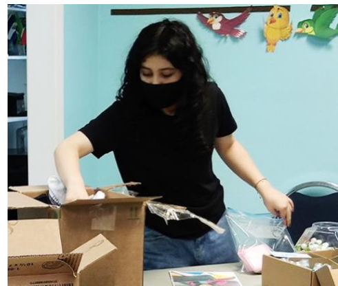
A Cabrini Kid makes packs of toiletries, socks and essentials for "First to Heal".