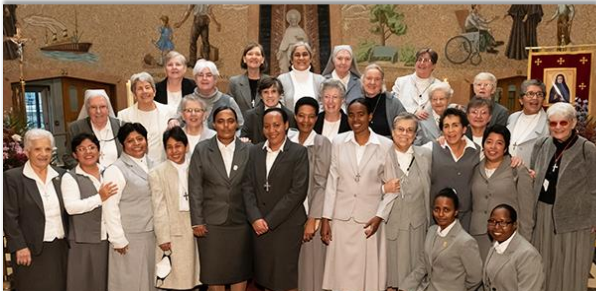
United as Bearers of Christ’s Love, the Missionary Sisters of the Guadalupe Province surround the newly professed Missionary Sisters in a joyful celebration of welcome and blessings. For more photos please click here