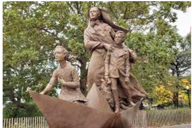
Statue of Mother Cabrini in Battery Park, New York