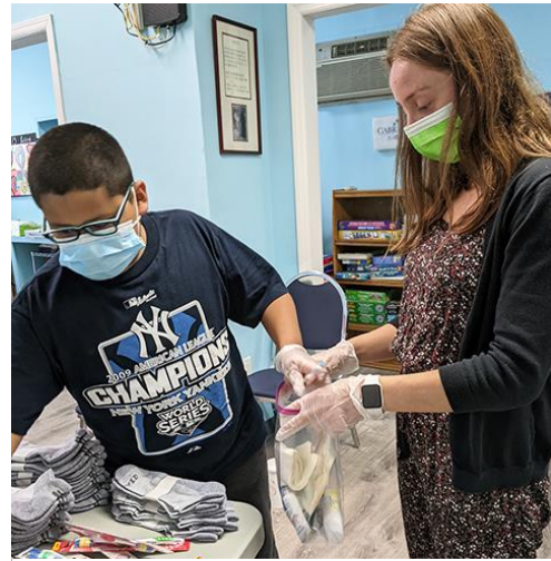
Cabrini Kids assemble packets for The Pantry in Verplanck, NY where they will benefit women in need.