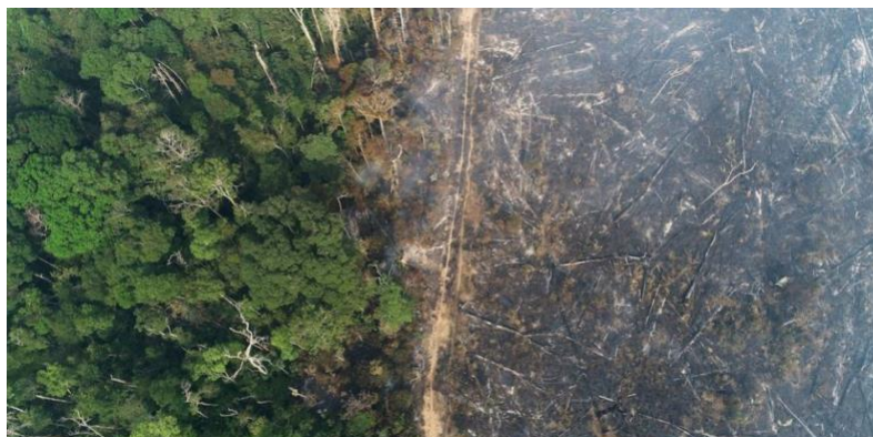
The Amazon jungle being cleared by loggers and farmers.

To read the complete article, please click here