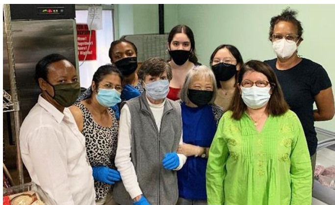
Photo above and right: Missionary Sisters and CMF staffers team up with volunteers to assist at the food CIS- NYC food pantry.

The Cabrini Mission Foundation responds with boldness and urgency to the unmet needs of the most vulnerable, especially when there are those in need in our own community. During the summer season, our team worked with Cabrini Immigrant Services' NYC Food Pantry, and has been dedicated to supporting and feeding more than 200 families each week.