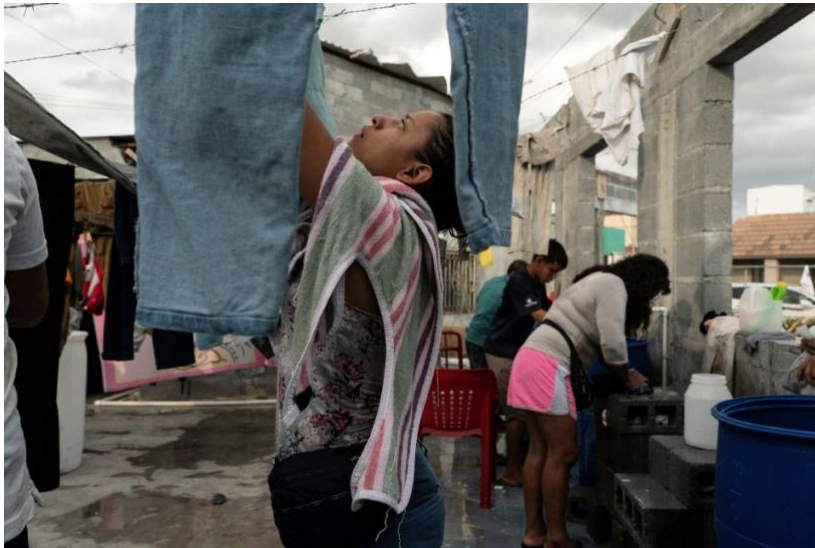
Asylum-seeking migrants from Central America do their laundry in the public square of Reynosa, Mexico.