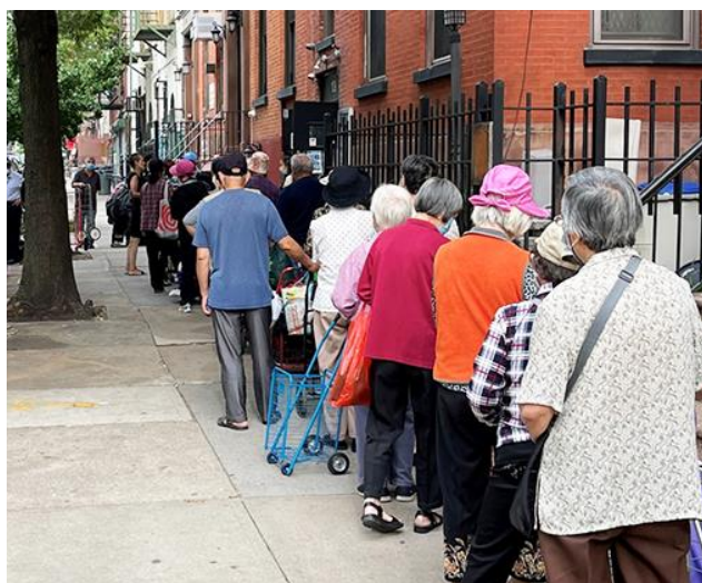
People wait in line to visit the Cabrini Immigrant Services food pantry in New York City.

Whether it was lugging groceries up numerous flights of stairs or working as a team to fill the bags of food, our Sisters, staff, and volunteers worked tirelessly to provide meals for the disadvantaged. Though many of us come from different backgrounds, speak different languages or come from various parts of the world, we came together to “answer the call” for help, as Mother Cabrini did throughout her lifetime.