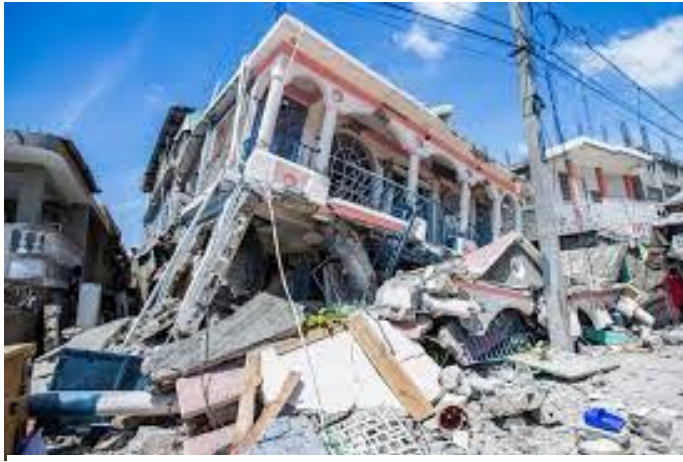
Scenes in Haiti from the devastation following the earthquake last month.

Every day we seek to continue Mother Cabrini's legacy and lifelong commitment to the dignity, development and empowerment of all people, especially during natural disasters, and to do so, the Cabrini Mission Foundation responds with urgency to provide immediate assistance to those in need. The devastation that has swept through Haiti following last month's magnitude 7.2 earthquake has left thousands of people without basic necessities, food, housing and access to life-saving medical attention.