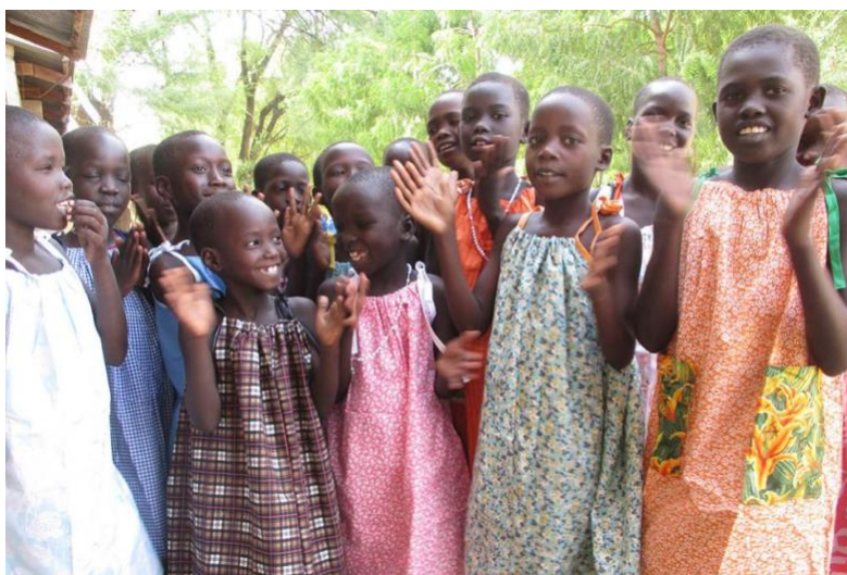
Girls from different ethnic groups attend the St. Bakhita School in Narus, South Sudan. The school is one of the best examples of people in different groups living peacefully, side by side.

"Corruption is endemic and intranational conflicts, economic collapse, crime and hunger ravage the population," said Sr. Joan Mumaw, president of Friends in Solidarity, the U.D. partner to Solidarity with South Sudan, a collaborative ministry of religious congregations of men and women.