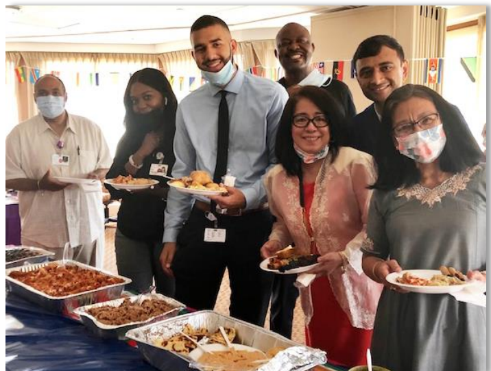
Many Cabrini of Westchester staff members enjoyed the delicious feast of dishes from the various countries such as samosas from India and challah from Israel.

On June 30th, the members of Cabrini of Westchester's Cultural Awareness Committee organized a Multi-Cultural Celebration to honor the many different ethnic backgrounds of the staff members employed by the nursing home. The festivities began with a parade of flags and traditional wardrobe and