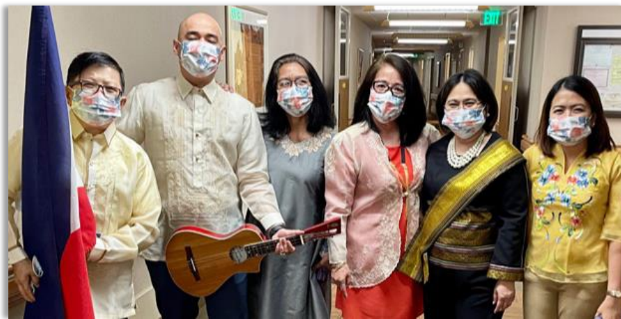
Beautiful costumes were on display from the Philippines.

ended with a display and tasting of dishes from various countries. Many thanks to the members of the Cultural Awareness Committee and all participants for making the day such a fun, festive and educational experience as we learned about cultural diversity!