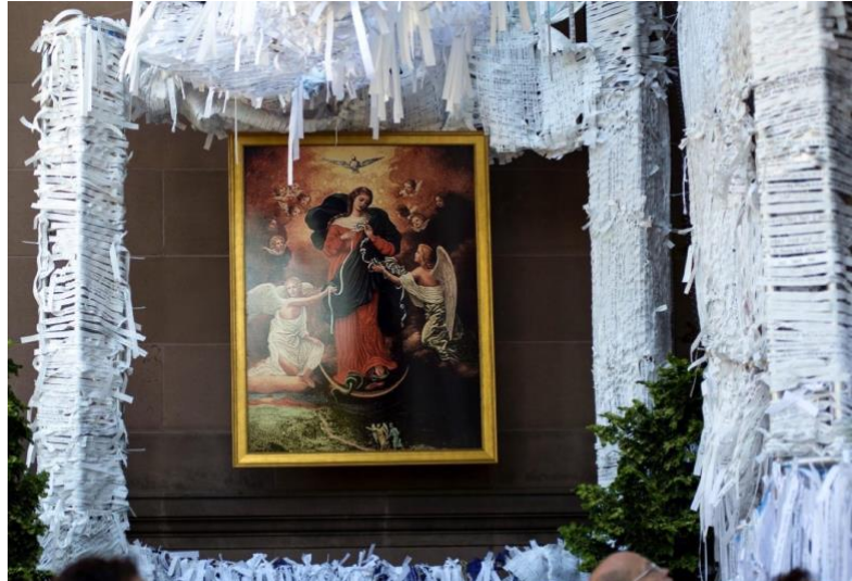
A painting of Mary, Undoer of Knots, hangs within the Knotted Grotto at the Cathedral Basilica of SS. Peter and Paul in Philadelphia during the World Meeting of Families in September 2015.

The rosary in the Vatican Gardens concluded a month of special recitations of the rosary from Marian shrines and parishes around the world, all with the intention of asking Mary’s intercession to help end the coronavirus pandemic and to give strength to people working to end it or suffering its effects. To read the entire article please click here