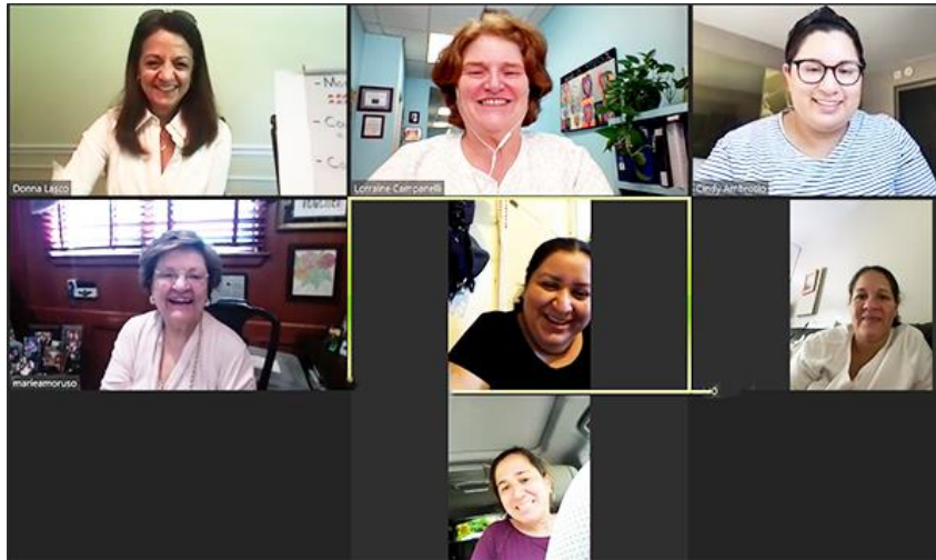
Homework workshop presenters and participants gather via Zoom.

Cabrini Immigrant Services (CIS) Dobbs Ferry, NY, offered a workshop, via Zoom, for some of our parents. The workshop was held once a week for 4 weeks. CIS wanted to help the parents work with their children when they arrive home from school as well as preparing their younger children who are still at home.