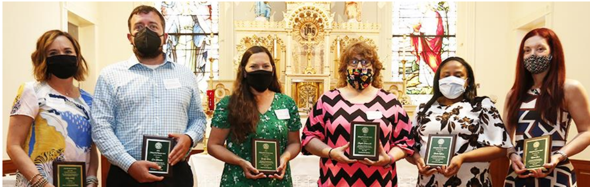
These are the elementary school teachers nominated by their former grade school students who have now received the Distinguished Educator Award conferred by Cabrini High School.

Each year, Cabrini students who demonstrate outstanding character and hold a GPA of 3.5 or higher are given the opportunity to nominate an elementary school teacher who has had a positive impact on their lives. In the nomination, students are asked to share why they selected the teacher and the impact the nominee has had in their lives and preparation for high school and beyond.