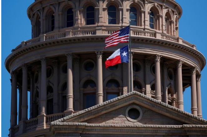
The Texas State Capitol in Austin is seen in an archived photo. The State House of Representatives passed a new voting restrictions measure by a 81-64 vote on May 7, 2021.

“As women of faith and faithful Americans, we believe that all people have the right and obligation to participate fully in our democracy,” the sisters’ statement said, adding that they “strongly oppose all attempts to restrict that participation by limiting the sacred right to vote.”