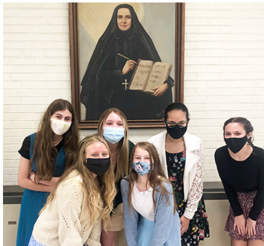
Showing their sense of style as they bring awareness to the important cause of anti-human trafficking are these CHS students.

Founded by Mother Cabrini, the Missionary Sisters of the Sacred Heart of Jesus support two corporate stances, “To support the rights and dignity of all immigrants” and “To stop human trafficking.” This is the driving force behind Cabrini High School’s efforts to fight human trafficking. In keeping with Mother Cabrini’s own service to immigrants and migrants, today’s