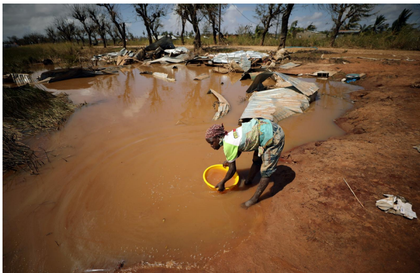
A woman collects water for washing as floodwaters begin to recede in the aftermath of a 2019 cyclone near Beira, Mozambique. Many climate scientists have associated an increased number of natural disasters and their severity with climate change.

phenomena that endanger the common good; c) the purposeful denial of reality to protect vested interests; d) misunderstanding.”