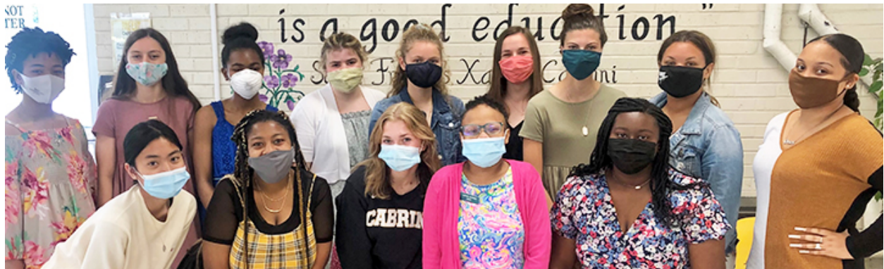
Cabrini High School students are fashion-forward as they support anti-human trafficking initiatives.

NEW ORLEANS – Cabrini High School helped fight human trafficking on Friday, April 16, 2021 by participating in “Sun’s Up, Dress Up.” In place of the school’s annual Dressember promotion against human trafficking, Cabrini was inspired with the spring weather for “Sun’s Up, Dress Up,” a collaboration among all students leveraging fashion and creativity to promote the dignity of all women and stand in solidarity against the modern injustice of human trafficking.