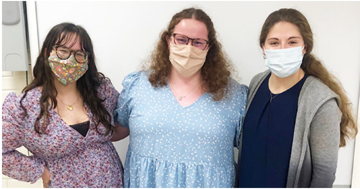
CHS students will make a difference in the fight against human trafficking by their participation in Sun’s Up, Dress Up.