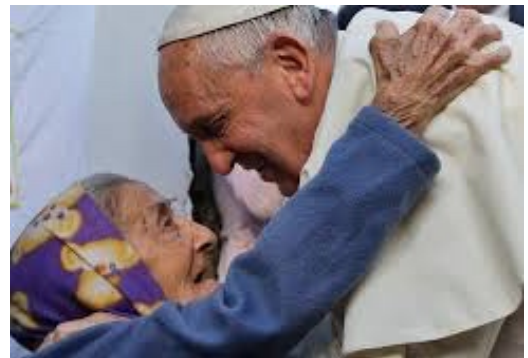
Pope Francis receives a hug from an elderly woman and shares a warm smile.

VATICAN CITY (CNS) To express the closeness of God and of the church to every older person, Pope Francis has chosen “I am with you always” from the Gospel of Matthew as the theme for the first World Day for Grandparents and the Elderly.