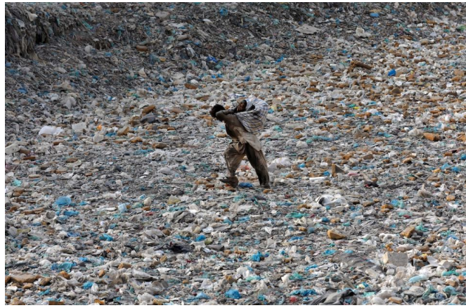
A boy carrying a sack of recyclables walks through fields of trash in Karachi, Pakistan in 2020.

To read the full account, please click here