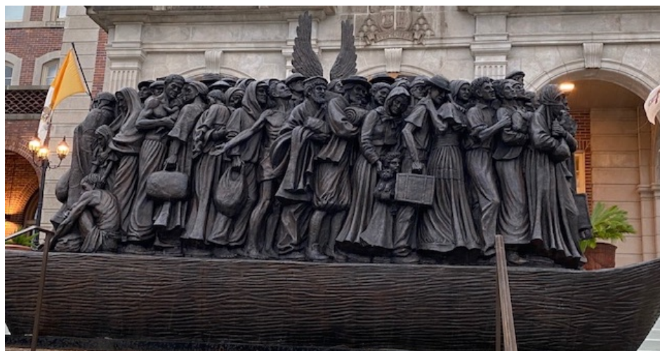
“Angels Unawares” on display in New Orleans, LA

on permanent display at the Catholic University of America.