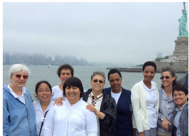
We thank and celebrate all our Missionary Sisters during Catholic Sisters Week!