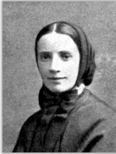
St. Frances Xavier Cabrini