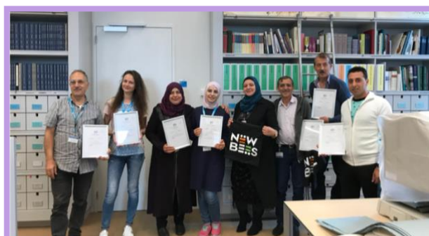
Photo 6, 7, 8, 9 Photo Credit from the left: NewBees, Mission Driven Finance and EcoFiltro, three of the organizations we are supporting through our impact investing work.