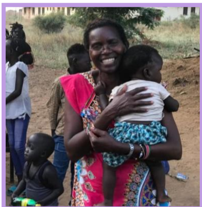
Photo 13. Christmas celebrations for families and children in Kit, South Sudan (December 2020)

A Reflection Over My Years in Mission of The Essence of Love