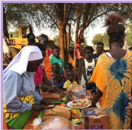
Photo 15. Christmas celebrations for families and children in Kit, South Sudan (December 2020)

The Essence of Love is “whole”-hearted and for the whole of one’s life. It is incarnated, made flesh and lives on beyond the words and actions, in a