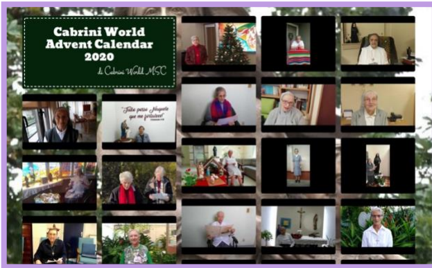
Photo 10. Cabrini World Advent project involving more than 80 elderly Sisters.

Throughout 2020 each of us has been challenged in different ways, individually, socially and economically. Together we witnessed how the pandemic accelerated and amplified many global events: increasing polarization within and between nations and the rise of