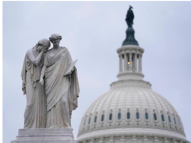
The U.S. Capitol as seen from The Peace Monument.