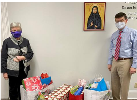
CHS adopted three families for Christmas making their holiday brighter.

To wrap up the semester before Christmas break, Campus Ministry coordinated with Catholic Charities Archdiocese of New Orleans to "Adopt a Family" for Christmas. Due to the sock drive and Cabrini being virtual for the week after Thanksgiving, the school was unsure if it were possible to sponsor any families this year. However, when our Campus Minister learned there were three families unclaimed, CHS jumped at the chance to help. Religion classes donated to two families, and the faculty and staff sponsored the remaining family. All items on these families' wish lists were bought and donated to ensure they have a "Merry Christmas."