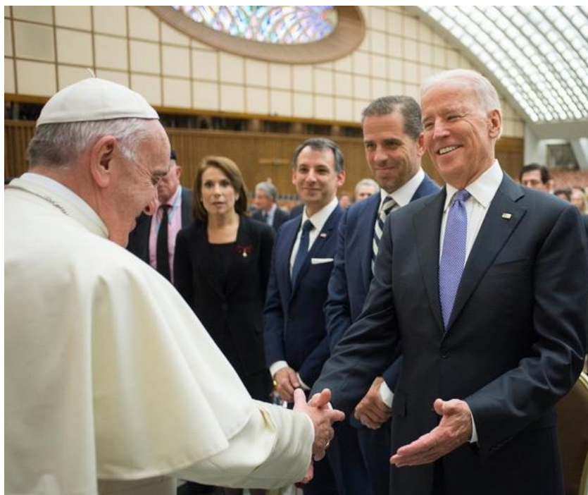
With his son Hunter (l) looking on Joe Biden extends his hand as he greets Pope Francis.

In a message of “cordial good wishes” to President Joseph R. Biden, Jr. after his installation as the 46 th president of the United States, Pope Francis assured him of his prayers that “Almighty God will grant you wisdom and strength in the exercise of your high office.”