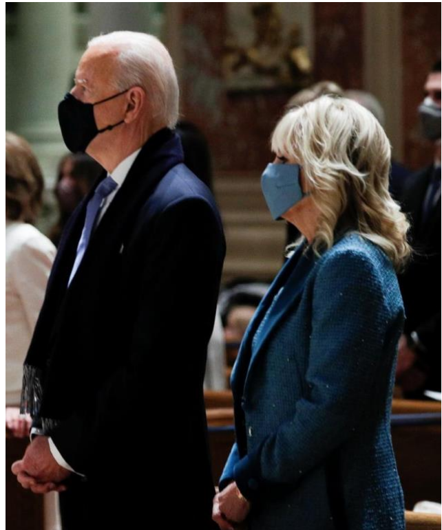
President Joe Biden and Dr. Jill Biden began Inauguration Day by attending Mass at St. Matthew Cathedral inviting congressional leaders to join them.