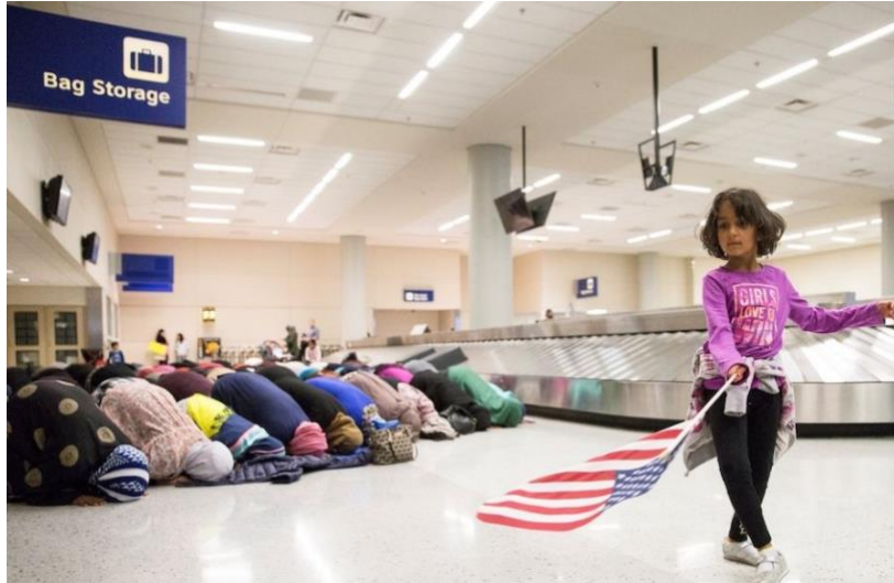
A young girl dances at the Dallas/Fort Worth Airport in January of 2017 as women pray during a protest against a travel ban imposed by President Donald Trump's executive action.